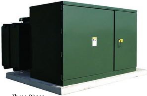
Three Phase KVA (75-5000)

Parts Super Center has access to the complete technical records on all Padmount transformers manufactured from 1970 to today.