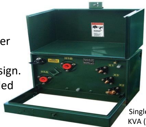
Single Phase KVA (10-167)

Flip over this sheet to find out what information we need from the nameplate to get started!